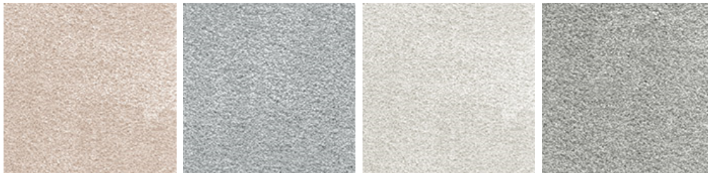
SECRET NEW 62