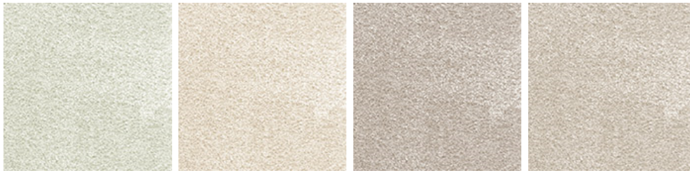
SECRET NEW 28