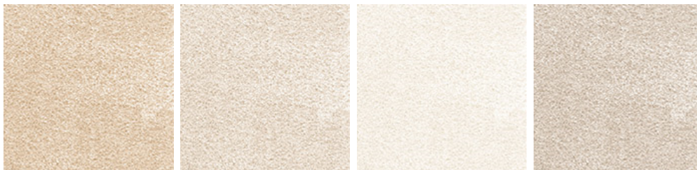
SECRET NEW 04