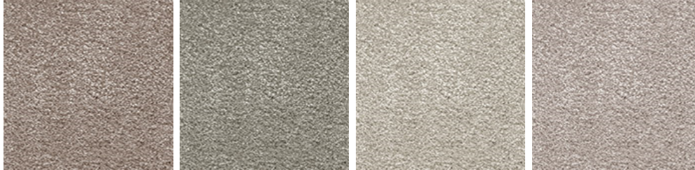
SECRET NEW 44